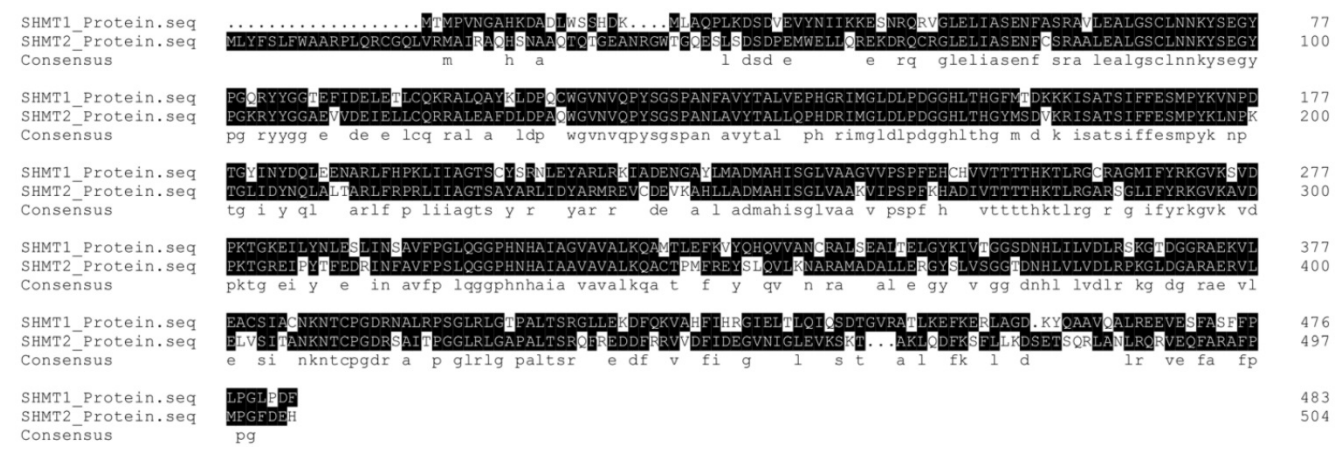
Figure 3. Sequence of the protein SHMT2 aligned with SHMT1. Identical residues are highlighted in dark

in human tumour, we reviewed the current studies in multiple cancers for a comprehensive understanding of SHMT2.