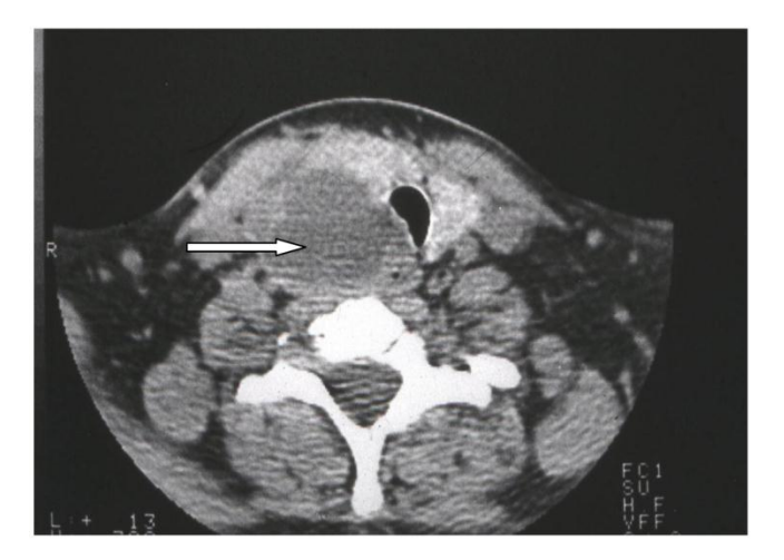
Figure 1: Enhanced neck computed tomography showing a cystic mass (arrow) at the inferior aspect of the right thyroid lobe with a tracheal compression.