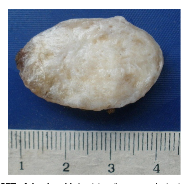
Fig. I Gross specimen of the SFT of the thyroid. A solid, well-circumscribed, white nodule with whitish cut surface.

The differential diagnosis of SFT of the thyroid gland includes Riedel thyroiditis, fibrosing Hashimoto's thyroiditis, leiomyoma, peripheral nerve origin tumors and undifferentiated carcinoma. Riedel thyroiditis and fibrosing Hashimoto's thyroiditis are diffuse fibrous mass with marked infiltrating lymwheras the SFT of thyroid well-circumscribed mass without notable lymphocytes. For leiomyoma and peripheral nerve origin tumors, immunohistochemical staining are specific positive for SMA and S-100, repectively, while nagetive for CD34 and Bcl-2. Undifferentiated carcinoma is charecterized by highly pleomorphic tumor cells that lack any organoid growth pattern. A component of papillary carcinoma, follicular carcinoma or poor differentiated thyroid carcinoma often can be found and express the epithelial markers.